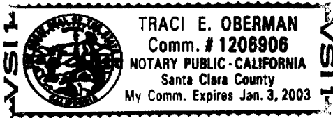
SIGNATURE OF NOTARY