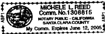
Signature of NOTARY