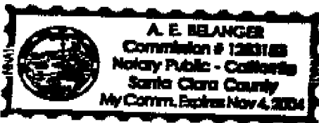
SIGNATURE OF NOTARY