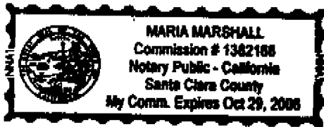
Place Notary Seal Above

to be the person(s) whose name(s) is/are subscribed to the within instrument and acknowledged to me that he/ she /they executed the same in his/ her /their authorized capacity(ies), and that by his/ her /their signature(s) on the instrument the person(s), or the entity upon behalf of which the person(s) acted, executed the instrument.