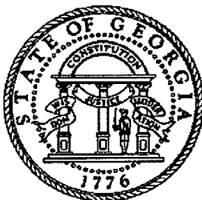
Karen C Handel Secretary of State

WITNESS my hand and official seal in the City of Atlanta and the State of Georgia on October 26, 2007