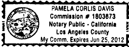
Place Notary Seal Above

Signature [Handwritten Signature] Signature of Notary Public