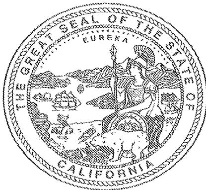
DEBRA BOWEN Secretary of State