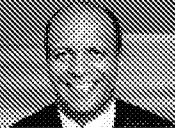
JESSE WHITE SECRETARY OF STATE