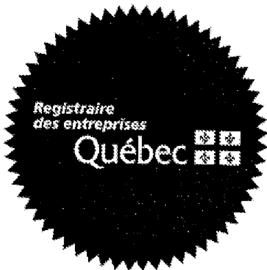
[illegible signature] Enterprise Registrar