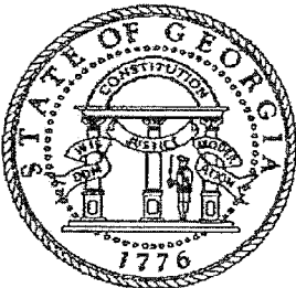
Karen C Handel Secretary of State

WITNESS my hand and official seal in the City of Atlanta and the State of Georgia on June 30, 2009