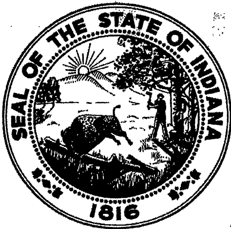
TODD ROKITA, SECRETARY OF STATE

In Witness Whereof, I have caused to be affixed my signature and the seal of the State of Indiana, at the City of Indianapolis, February 29, 2008.