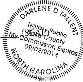
Randall L. Powers