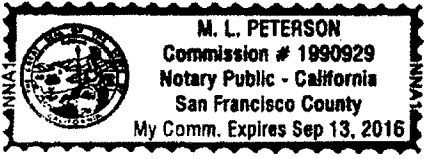
Place Notary Seal Above

Signature [Signature] Signature of Notary Public