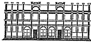
FB RICE & CO Patent and Trade Mark Attorneys