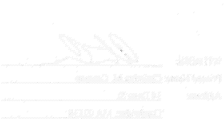
FIG. 4 FIG. 5