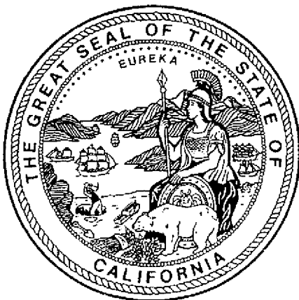
ALEX PADILLA Secretary of State

IN WITNESS WHEREOF , I execute this certificate and affix the Great Seal of the State of California this day of July 22, 2015.