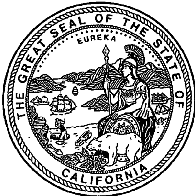
ALEX PADILLA Secretary of State

IN WITNESS WHEREOF , I execute this certificate and affix the Great Seal of the State of California this day of January 25, 2016.