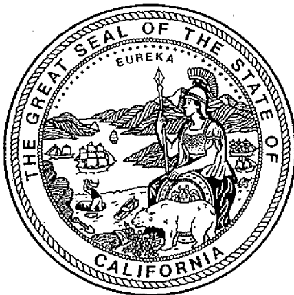
ALEX PADILLA Secretary of State

IN WITNESS WHEREOF , I execute this certificate and affix the Great Seal of the State of California this day of March 17, 2015.