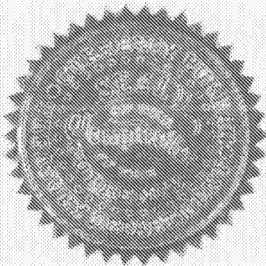
Comptroller of the Currency