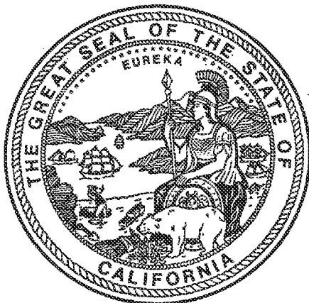
ALEX PADILLA Secretary of State

IN WITNESS WHEREOF, I execute this certificate and affix the Great Seal of the State of California this day of July 8, 2017.