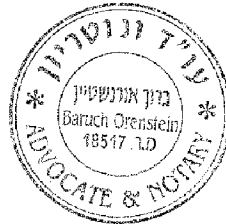
חותם הנוטריון Notary's Seal