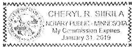
Notary Public Notary Seal

Subscribed to and sworn to before me this 17 day of August , 2017.