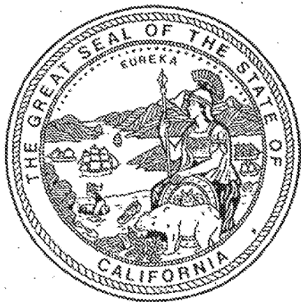
ALEX PADILLA Secretary of State

IN WITNESS WHEREOF, I execute this certificate and affix the Great Seal of the State of California this day of July 27, 2016.