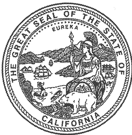
ALEX PADILLA Secretary of State

IN WITNESS WHEREOF , I execute this certificate and affix the Great Seal of the State of California this day of May 11, 2018.