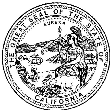
ALEX PADILLA Secretary of State

IN WITNESS WHEREOF , I execute this certificate and affix the Great Seal of the State of California this day of November 20, 2015.