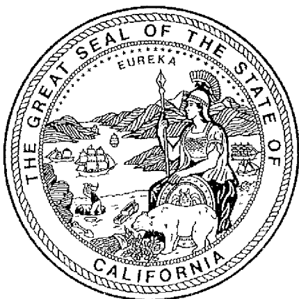
ALEX PADILLA Secretary of State

IN WITNESS WHEREOF , I execute this certificate and affix the Great Seal of the State of California this day of December 21, 2015.