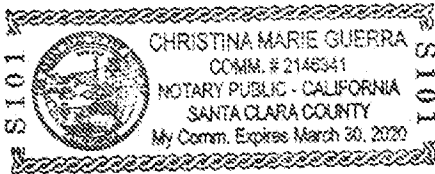
Place Notary Seal Above