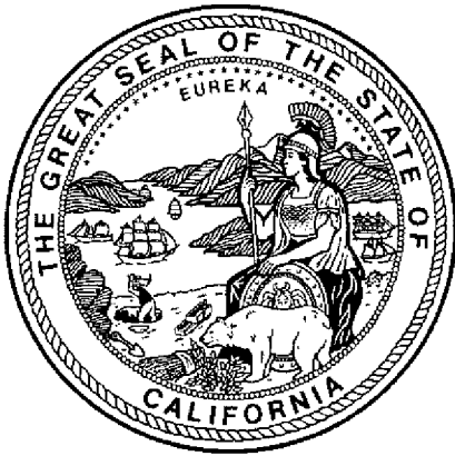
ALEX PADILLA Secretary of State

IN WITNESS WHEREOF , I execute this certificate and affix the Great Seal of the State of California this day of October 29, 2020.