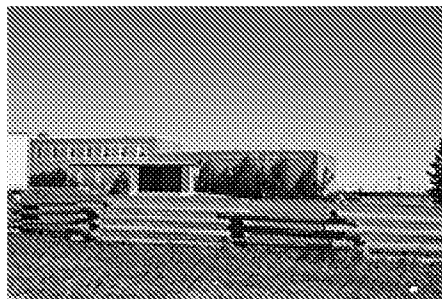
Museum of the Plains Indians

The Indian Arts and Crafts Board is an agency within the Department of the Interior whose mission is to "promote the economic development of American Indians and Alaska Natives through the expansion of the Indian arts and crafts market". [1] It was established by Congress in 1935. It is headquartered at the Main Interior Building in Washington, D.C.