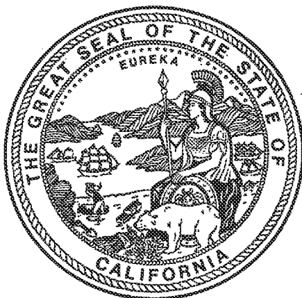
ALEX PADILLA Secretary of State

IN WITNESS WHEREOF, I execute this certificate and affix the Great Seal of the State of California this day of July 8, 2017.