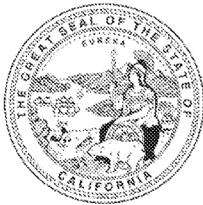
SHIRLEY N. WEBER, PH.D. Secretary of State

IN WITNESS WHEREOF , I execute this certificate and affix the Great Seal of the State of California on April 29, 2022.