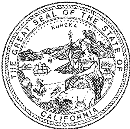
ALEX PADILLA Secretary of State

IN WITNESS WHEREOF , I execute this certificate and affix the Great Seal of the State of California this day of January 26, 2019.