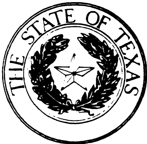
Alberto R. Gonzales Secretary of State