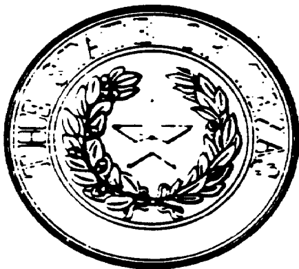
Alberto R. Gonzalez, Secretary of State