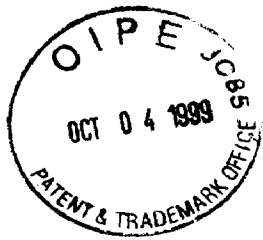
EXHIBIT B TO COLLATERAL ASSIGNMENT OF TRADEMARKS