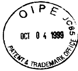
EXHIBIT A TO COLLATERAL ASSIGNMENT OF TRADEMARKS