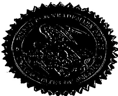
Commissioner of Patents and Trademarks