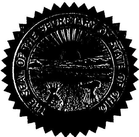
J. Kenneth Blackwell Secretary of State

A handwritten signature in cursive script that reads "J. Kenneth Blackwell".