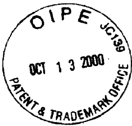
Exhibit A to Intellectual Property Security Agreement