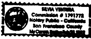
Place Notary Seal Above

Signature [Signature] Signature of Notary Public