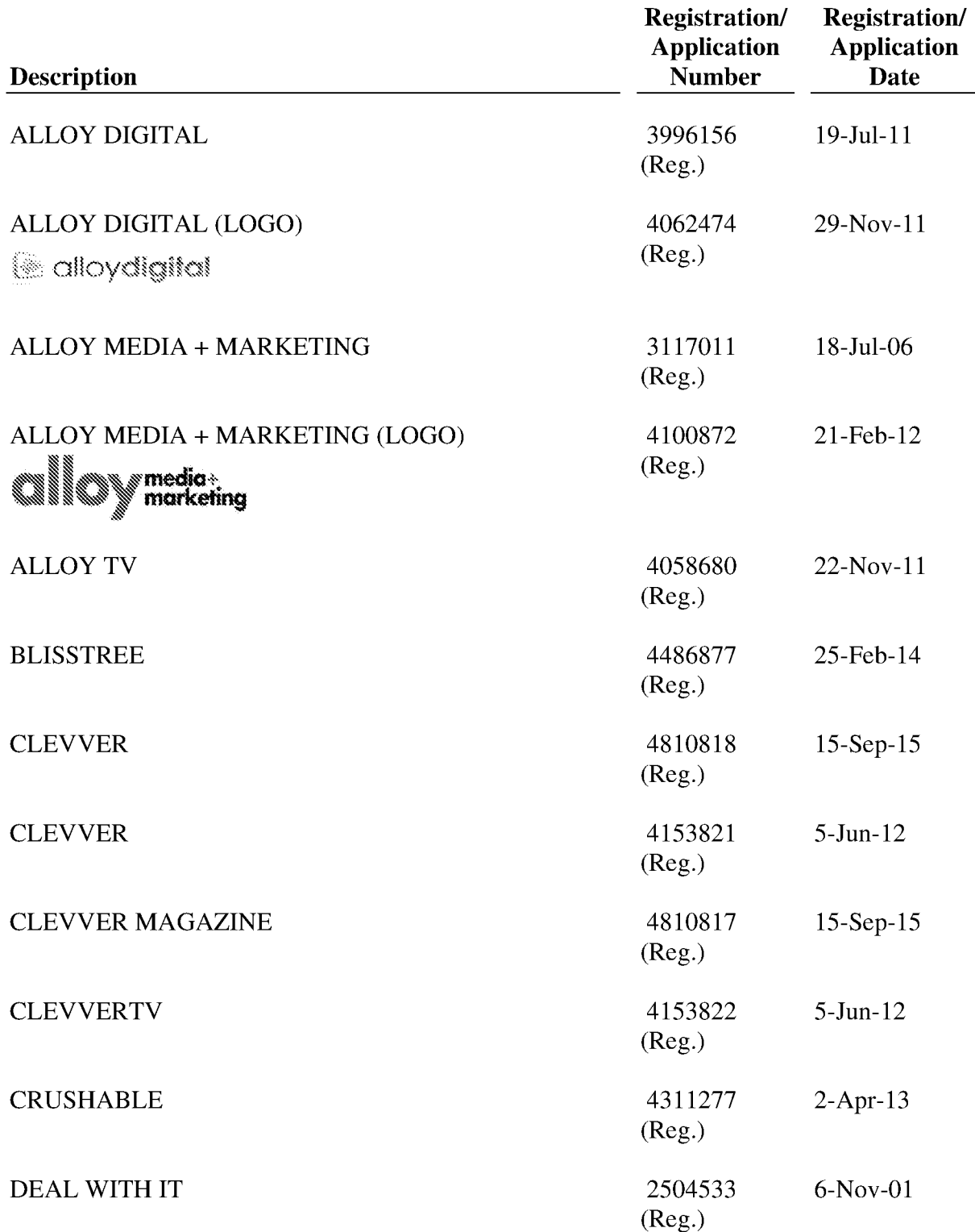
EXHIBIT C TRADEMARKS