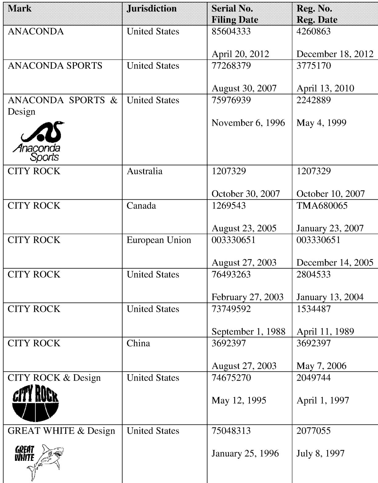
EXHIBIT A REGISTERED TRADEMARKS AND TRADEMARK APPLICATIONS