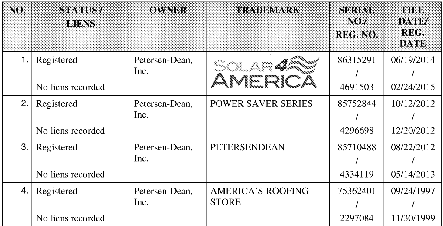
EXHIBIT A TRADEMARKS